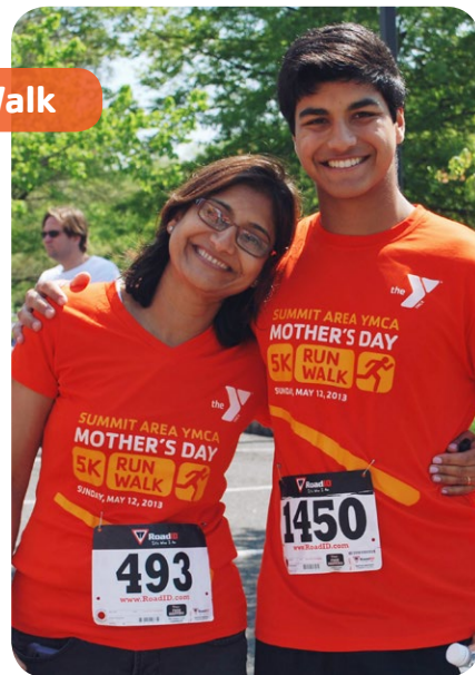
Summit Area YMCA 13th Annual Mother's Day 5K Run/Walk